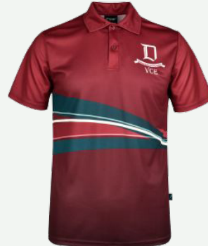
VCE PE Units 1 - 4 burgundy polo shirt