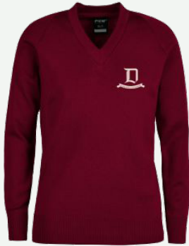
Senior School burgundy jumper

In Senior School, students have the option to purchase a burgundy jumper with College insignia. Students enrolled in PE Units 1 - 4 must wear burgundy Polo tops with College insignia.